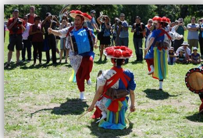
Montreal's "Komachi" group delighted the crowds at the 2012 Natsu Matsuri with Japanese folk dancing

We would like to encourage everyone to check out get-togethers such as the Terry Fox Run, our Japanese classes, the "welcome back" enka and the networking wine and sushi night. More details about these events are posted in this newsletter as well as on our website , Twitter and Facebook page .