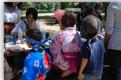
Children enjoyed donning their Japanese summer clothes and even learned some calligraphy