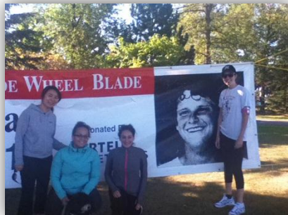
The 2011 JETAA Ottawa & Friends team at the Terry Fox Run

Proceeds from money raised will help the Terry Fox Foundation as it works to fund innovative and progressive cancer research programs.