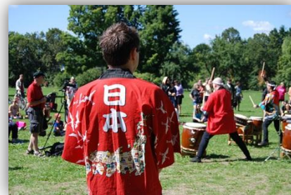
Oto wa Taiko drummed some powerful beats

Oto wa Taiko attracted people from all corners of the park to listen to their powerful drumming and watch their well-choreographed moves. Tateyama Dojo introduced ancient martial arts of Japan through their lively kendo, iaido and jodo demonstrations.