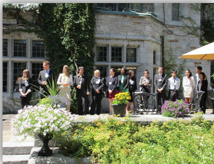
The 2012-13 JETs departing from Ottawa