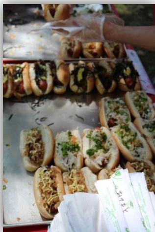
Free and delicious Japanese-flavoured JETAA dogs